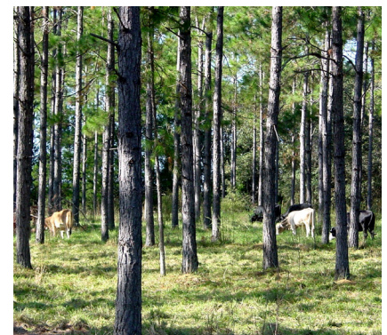
Silvopasture: Integration of trees and grazing livestock operations on the same land.