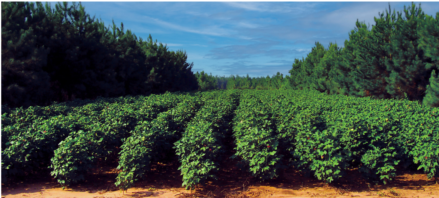
Cotton grows between rows of pine trees.

FOR PRODUCER PROFITABILITY AND CLIMATE STABILIZATION